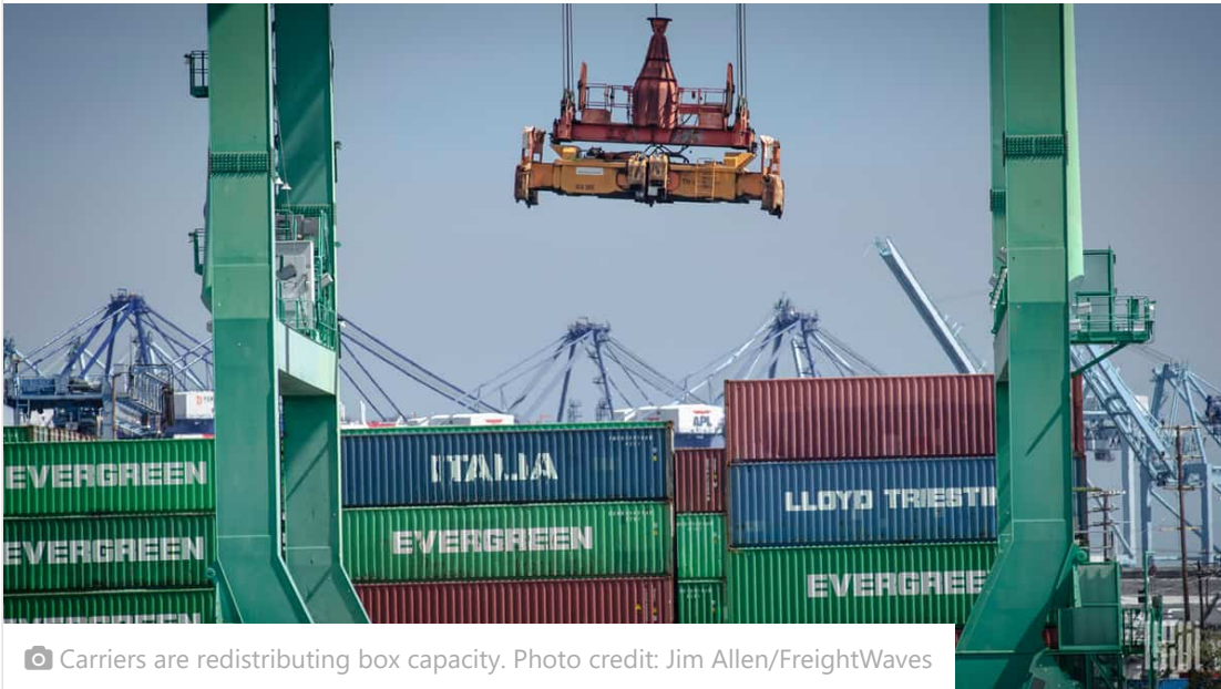
Carriers are redistributing box capacity.